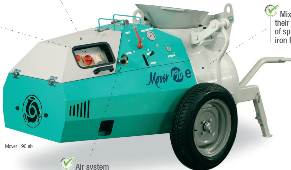
Mover 190 eb

Mixing paddles and their supports made of spheroidal cast iron for longer life